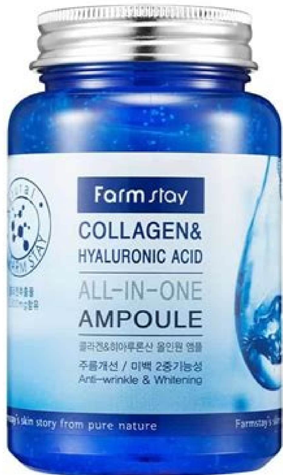
Hyaluronic acid mask sheet the saem. Hyaluronic acid mask sheet how to use. Tony moly hyaluronic acid mask sheet. Master lab hyaluronic acid mask sheet. Tonymoly pureness 100 hyaluronic acid mask sheet. Etude hyaluronic acid mask sheet. Tonymoly pureness 100 hyaluronic acid mask sheet review. Best hyaluronic acid mask sheet.